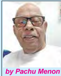
by Pachu Menon

But whichever way one looks at it, it is more than evident that crime is an integral part of the society!