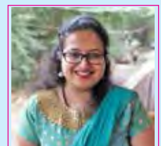
by Sonal Lobo Bangalore

I write to make a difference I write to tickle slightly someone's heart I write to bring a smile I write to make you think at least for a while. I write and I shall continue I write. Yes, I write.