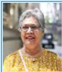
by Vera Alvares

The battery is a sturdy structure that has stood the test of time. However, it is reminder of the man at whose hands a whole community had suffered. On the flip side, this era also revived with gusto the cultural practices such as the celebration of the Harvest Festival, of a people that dwell on the shores of the Arabian sea!