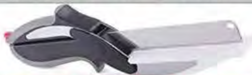
Chop Chicken Onto Your Salad