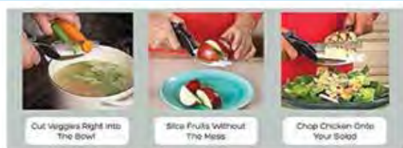
Cut Veggies Right into The Bowl