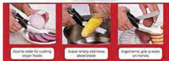
Opens wide for cutting larger foods