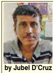
by Jubel D'Cruz

250 gms French beans, cut into 1/2- inch pieces, or as desired 1 onion , sliced 2 green chillies, slit lengthwise 3 tbsp cooking oil 1/2 tsp mustard seeds 1/2 tsp cumin seeds (jeera) 8 curry leaves 3 Kashmiri dry red chillies, broken 6 tbsp fresh coconut, grated Salt to taste A pinch of sugar