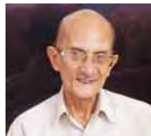
BY MELVYN BROWN

I was intrigued to learn that the professor's address opened with a disturbingly different explanation of Hinduism from what I had known, embellished with thought provoking contradictions, discovered in the Vedas.