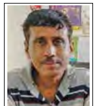
by Jubel D'Cruz

Let all of us Indians therefore take up the responsibility to realise the dream of Swachh Bharat (clean India), change our mindset, and learn from the world's cleanest countries and adopt their techniques to keep our neighbourhoods and country always clean.