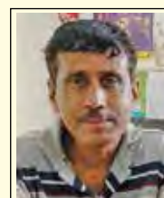
by Jubel D'Cruz

Cook the fish till its done over low flame. Once done, transfer it to a serving platter and garnish it with coriander leaves. Serve it with steamed rice.