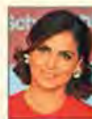
LARA DUTTA Actress