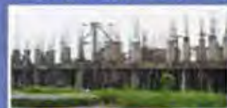
Jyoti Construction W.I.P.