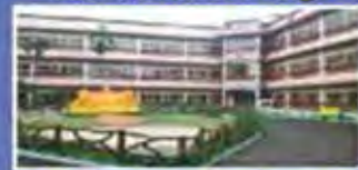
Nishkalanka Seva Home