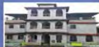
Convent Pallotti Cottage