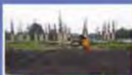
School Construction W.I.P.