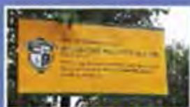
St. Vincent Pallotti School