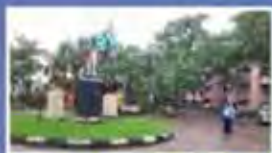
Vishwadeep C. H. S. L.