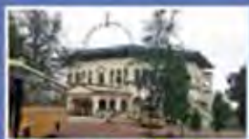
Christ the King Church