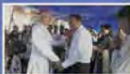
Jyoti Residency Inauguration

Behold, how good and how pleasant it is for brethren to dwell together in unity! Psalm 133:1