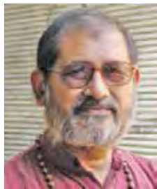
by chhotebhai *

The problem arises when one encroaches on the competence of another, as with Darwin or Galileo. Science teaches us that for 20 billion years creation has been evolving, and still is. The Genesis account of creation is divided into seven days. That may be interpreted as seven stages of creation that are actually compatible with science – heat, light, gas, liquid, solid etc.