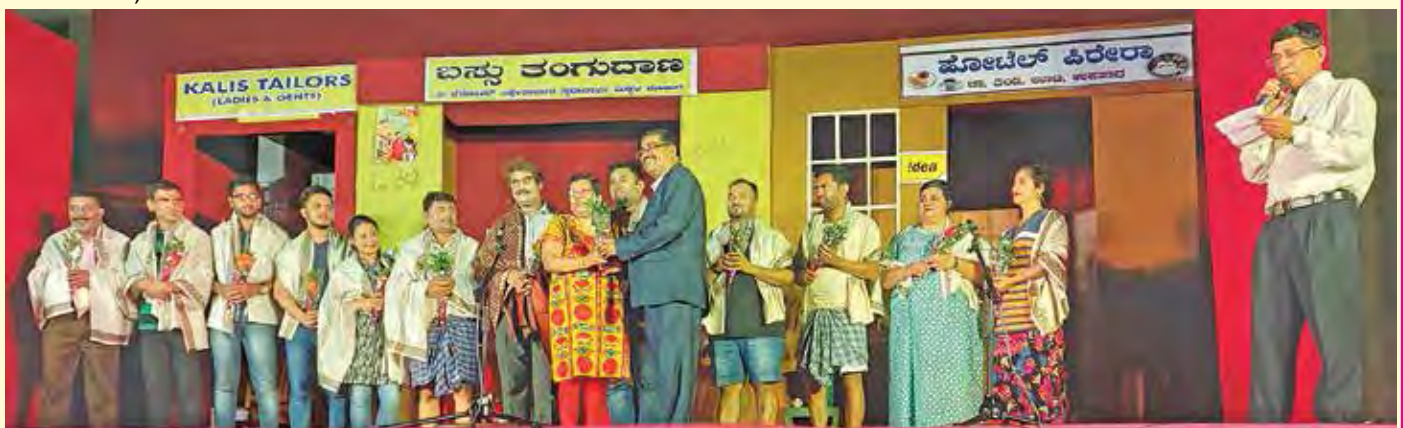
Konkani comedy drama from Dubai Troupe 'Vechogi Raavncho' staged at Jerimeri Mumbai by Maharashtra Konkani Association on 1st December 2019