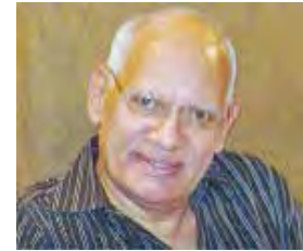
by Marshall Sequeira

The Parliament witnessed turmoil over the issue of Electoral Bonds which the NDA government introduced in their 2017 budget. The opposition parties led by the resurgent Congress mounted a scathing attack on the government.