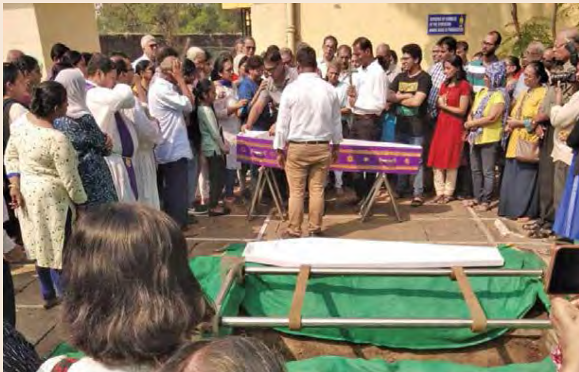
Shroud burial at Mulund Cemetery on Sunday