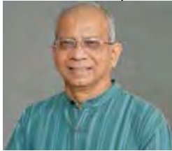
BY FR. CEDRIC PRAKASH, SJ

E xactly, seventy years ago on 26 November 1949, the Constituent Assembly of India adopted and gave to “we, the people” a landmark Constitution. ‘The Constitution of India’ is the sacred book of every Indian citizen; it is a bulwark of fundamental rights and directive principles, which are a prerequisite for any healthy democracy. The Preamble, with its emphasis on justice, liberty, equality and fraternity and its commitment to India being and remaining a “sovereign socialist secular democratic republic” spells out the vision and the intrinsic character of the Constitution. The Constitution of India with its minute details is undoubtedly a unique one. Thanks to the vision of women and men of the Constituent Assembly, we can take genuine pride in a Constitution which is forward-looking and all-embracing and which respects the pluralistic fabric of the country.