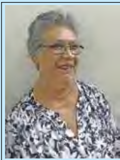
by Vera Alvares

ers by profession, lived at the mercy of the land-owners of the area, who exploited them mercilessly. Amidst the bare hills and dismal surroundings, hope and laughter were kindled to drive away the darkness of tears and desperation. Now they have built their settlement on top of a barren hill and till tracts of unused government land to produce legumes and vegetables. The hunger in their bellies and the disease in their bones have been replaced by smiles on their dark, handsome features!