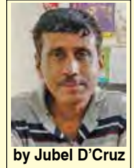
by Jubel D'Cruz

250 gms maida 200 gms sugar 4 eggs 120 gms butter 1 tsp baking powder 350 gms raisins 100 ml rum Few drops vanilla essence 150 gms lemon peel 50 gms walnuts 30 gms crystallised cherries