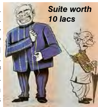
Suite worth 10 lacs

true," said a Roman senator (Cicero). Here, the tenacity of truth goes by majority..... And according to our precious tradition, the majority cannot be wrong!