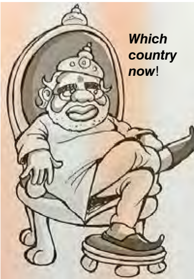
Which country now!

It is highly unfortunate for our democracy that here any issue is made BJP against opposition and merit os not considered on the nature of the issue but on majority basis. The truth for its tenacity does not depend on majority. "99 can be wrong against 1 if it is