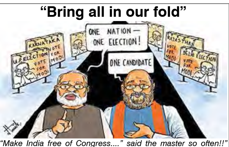
"Make India free of Congress...." said the master so often!!" Only our party... Democracy Jai Ho."

rant masses. Once in power, the elected member convenientlv ignores the masses that elected him. His first and the only lovalty is his party. No country.... No public. Recently this trend