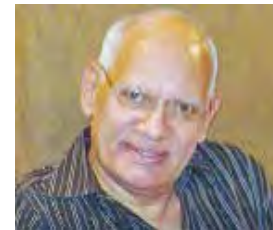
by Marshall Sequeira

In the first place, the marriage of convenience in Karnataka between the JD[S] and the Congress soon after the electoral result was a fall-out of the same machinations employed by the BJP in Goa earlier where the Congress was the largest party. It was not swift enough to grab the opportunity. The BJP was faster. The Congress in turn did likewise in Kar-