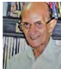
BY MELVYN BROWN

True faith is in the firm discipline of knowing that all things are possible