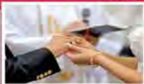
You have set a date for that once in a lifetime special occasion your Wedding Day