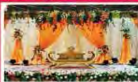
Our Creative, Elegant & Professional Decor to Wow your Occasions