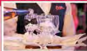
Impeccable Food & Service well groomed service staff