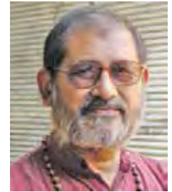
by chhotebhai *

The British monarchy is probably still the most popular in the world, besides being the oldest extant one. It dates back to William the Conqueror in 1066. In modern times it may also be popular because of its attractive princesses; from the blonde leggy Diana, to the petite brunette Kate and the burnished bronze Megan. I am not thinking of the princesses but of another British monarchical tradition. When a monarch dies the official announcer cries out "The king is dead. Long live the king".