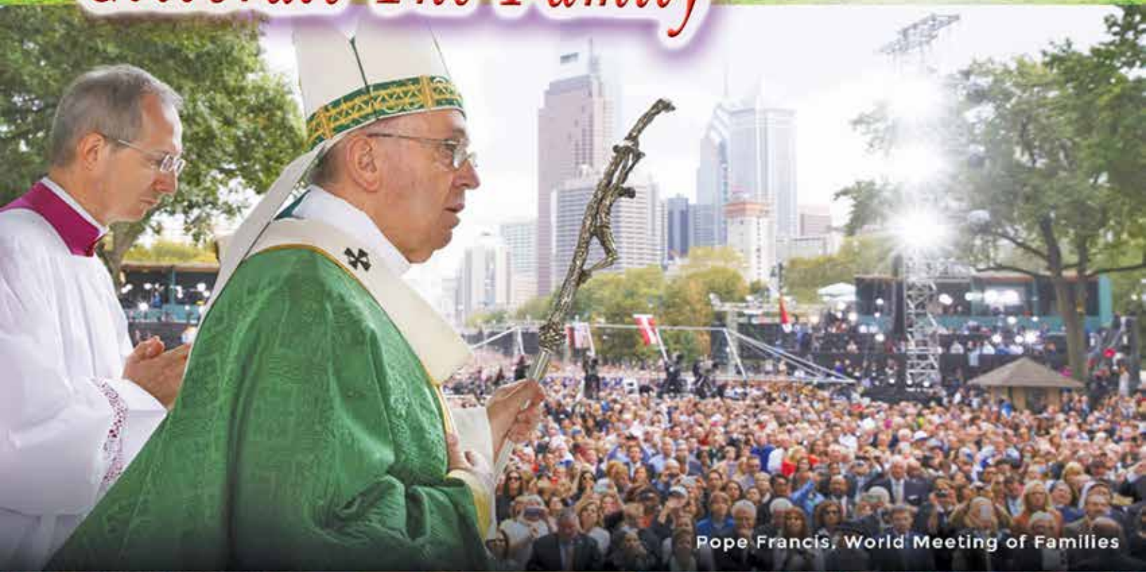
Pope Francis, World Meeting of Families