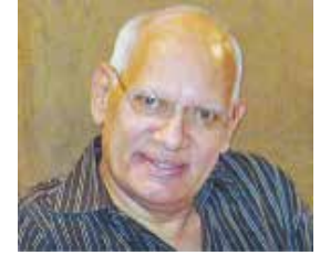
by Marshall Sequeira

Time is running out for Pakistan but its belligerent approach hastened its downfall. The world has been watching silently this wayward nation openly abetting and encouraging UN designated terrorists. These elements have been emboldened by the patronage of the armed forces and now they want to