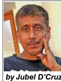
by Jubel D'Cruz

“The history of life on Earth has been a history of interaction between living things and their surroundings. To a large extent, the physical form and the habits of the earth’s vegetation and its animal life have been moulded by the environment. Considering the whole span of earthly time, the opposite effect, in which life actually modifies its surroundings, has been relatively slight. Only within the moment