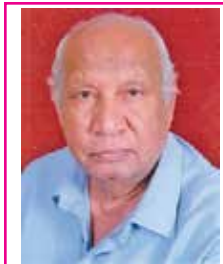
by Ignatius Dabhi Sr. Journalist

Gautam Adhikari of the Times Of India, in his 'Is Democracy Dying?' (TOI Feb 17, 2018) on the Editorial Page states : Evidence is rising it can be subverted by populist authoritarians who sap democracy from inside. Is fear and anxiety are all not ill-founded. Democracy in India seems to undergo a drastic change. A thumping and an overall majority of the party victory creates a silent dictatorship within the apparent democracy. Democracy only fulfills the expectations and aspirations of the silent voters when the media is free, journalists are under no pressure, daily newspapers and TV channels are bought or sold, where people are educated and well informed..... Is it so in India ? Are our people educated enough to understand ? Do our people in India ever realise whether the given promises during the hectic poll campaigns are real or mere poll rhetorics ? Does our election commission or some controlling body have any legal pressure over poll promises and Netaji's poll rhetorics ? What if poll promises are not being kept ?