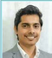
by Brendon Faife. B'lore

B angalore, now Bengaluru, is known to be India's IT capital and rapidly going famous for its numerous pubs, its mouth-watering restaurants, its parks and its nightlife. But on the flip side there are also its sky rocketing real estate prices, lakes which froth at the mouth and of course the icing on the cake - the traffic snarls. There are a number of reasons why the traffic is bad. The chief reason being, like in most of the other big cities in India - unplanned rapigrowth.