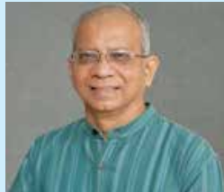
BY FR. CEDRIC PRAKASH SJ

A few days ago a twenty-seven year old poor Adivasi youth was lynched by a mob in the Palakkad District of Kerala for apparently robbing some Rs 200/- worth of foodstuffs; sadistically some others were busy taking selfies at the site, even as the youth was being thrashed to death. India is still trying to come to grips with the Rs.12000 crore PNB scam in collusion with Nirav Modi. Transparency International has just released its 'Corruption Perception Index 2017'; India has fallen two notches below from 79th to 81st position out of the 180 countries ranked. India was also singled out as one of the countries in the Asia-Pacific region as one of the "worst offenders" for graft, the denial of freedom of the press and for the murder of some journalists. Corruption, we are aware is today totally mainstreamed in the country today besides the Nirav Modi, there are among many others those of Jay Shah (the son of Amit Shah) and the Rafale deal scam.