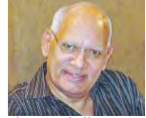
by Marshall Sequeira

Without going into the merits or demerits of the recent frustrations expressed in social media by some of soldiers of the Central forces, one is inclined to believe that in the name of military discipline, genuine problems of the foot soldiers not addressed. You cannot show the 'court martial' card and