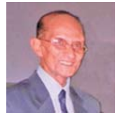
BY MELVYN BROWN

It is known that Europe, the stronghold of the Catholic faith is losing ground. The Church's longtime message of evangelization must be revived; the seeds of Christianity must once again germinate not only in the West but across the earth. In 2012 Pope Benedict XVI had clearly stated how "the bastion" of the Catholic faith in Europe was collapsing, and needed a resurgence