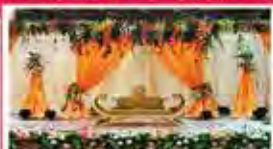
Our Creative, Elegant & Professional Decor to Wow your Occasions