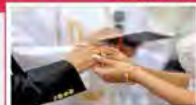
You have set a date for that once in a lifetime special occasion your Wedding Day