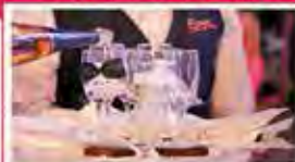
Impeccable Food & Service well groomed service staff