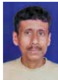
BY JUBEL D'CRUX

Since plastic bags are not biodegradable, the only way to get rid of them is to burn them up. Though lighting a match to them is easy, it has more than its fair share of disadvantages. The biggest of them is that smoldering plastics can release toxic fumes into the environment, in turn taking the air pollution to much higher levels.