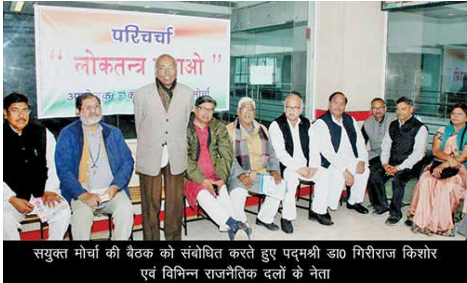
सयुक्त मोर्चा की बैठक को संबोधित करते हुए पद्मश्री डा० गिरिराज किशोर एवं विभिन्न राजनैतिक दलों के नेता