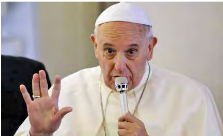
Vatican City: On Sunday Pope Fran-

cis spoke of the importance of remembering the day of our baptism, which he said is more than just a date on the calendar, but is the moment we receive our Christian identity and are immersed in the grace and forgiveness of God.