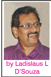
by Ladislaus L. D'Souza

The use and abuse of the media is an age-old phenomenon, the wind of criticism raging across the centuries, the situation during Alberione's time apparently being no different. But of him it can be said that he did something very concrete to set matters right!