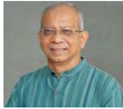
BY FR. CEDRIC PRAKASH SJ

October 31st is a 'special' day! Besides being the last day of a month, it is a day-filled with anniversaries and commemorations. As the clock ticks away into another new day and new month and one sits back and reflects on the day, a whole wave of HOT thoughts grips one's heart and soul. In these silent moments, one realizes that there are certain basics necessary for a meaningful way of proceeding. This day in some measure reminded us of these: